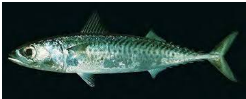
Gambar 1. Ikan Makarel ( Scomber japonicus )

There are several types of parasites that are zoonotic, which is a type of parasite that can infect fish and humans. One of the parasites zoonotic is Anisakis sp. which live as endoparasites in the intestines of fish. According to Hafid (2016) the risk of transmitting these worms to humans is relatively small because the fish consumed after going through the perfect heating process first causes the worms to die. However, fish infected with Anisakis sp. The nutritional content of the fish (meat) will decrease, as Muhdi argued in Hidayati (2016), the nature of parasites is to suck nutrients from their host.