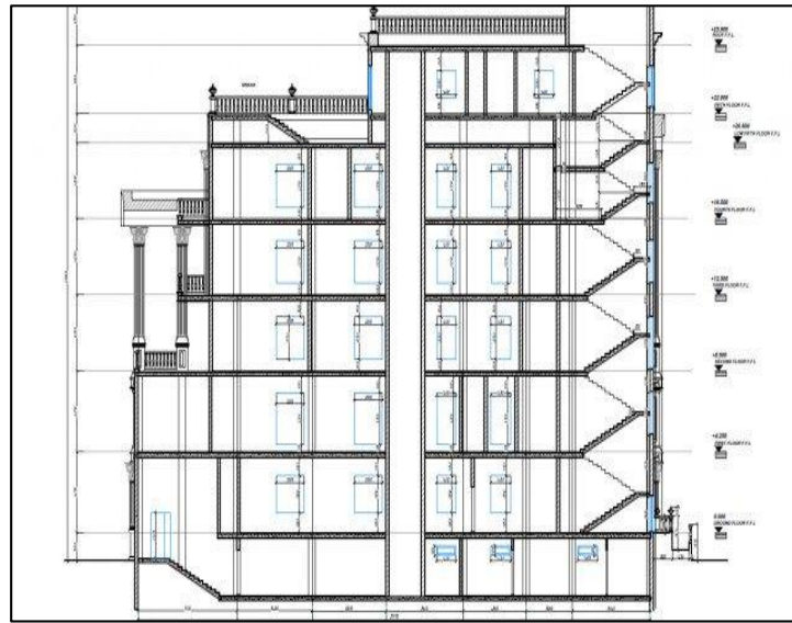
Figure 3 Luxury 3 storey building elevation plan

This study sought to ascertain how residents of Apartment residential buildings in the United Arab Emirates perceived their surroundings using the three-pillar paradigm. (Environmental–economic–social). Extrapolating indicators from important research carried out in various countries and having SMEs certify them are used to evaluate each of these pillars. All things considered, it was found that the three pillars of sustainability are interconnected; in the residential market of the United Arab Emirates, economic and environmental considerations have a greater influence on views of sustainability than social ones. Additionally, the comparison analysis showed that there is a statistical difference between the different demographic traits, including gender, educational attainment, employment status, and monthly income. Last but not least, a predictive categorization model was created to forecast if the intended audience will understand the sustainability concept (Roberts, A.,2019).