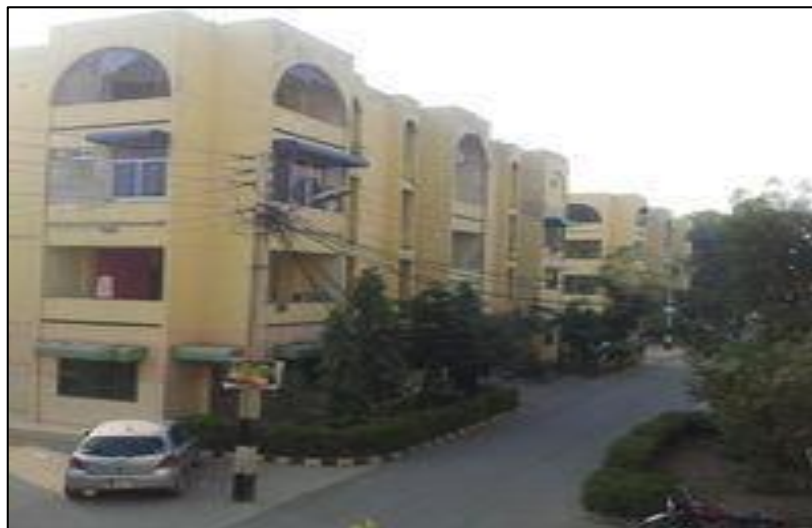
Figure 8: Apartment buildings in Lahore

The issue of urban housing is seen to be solved via vertical growth. The current study seeks to examine the topic of flat living in Lahore, Pakistan, from a variety of angles. However, the study was expanded to include the in-depth privacy experiences of adolescents because it was noticed that this age group was being severely underrepresented in both research and the distribution of privacy in apartments. Assessing inhabitants' contentment with and favorability of vertical living was the study's main objective. Although they are happy with the building's infrastructure, the residents do not favor vertical over horizontal housing. Because of the close quarters and shared space that come with vertical growth, adolescents in apartments also prefer horizontal dwelling to vertical living. The use of spaces within dwellings is related to specific aspects of personality development at this age. The research can be used to develop and execute policies for sustainable vertical housing (Fatima, 2019).