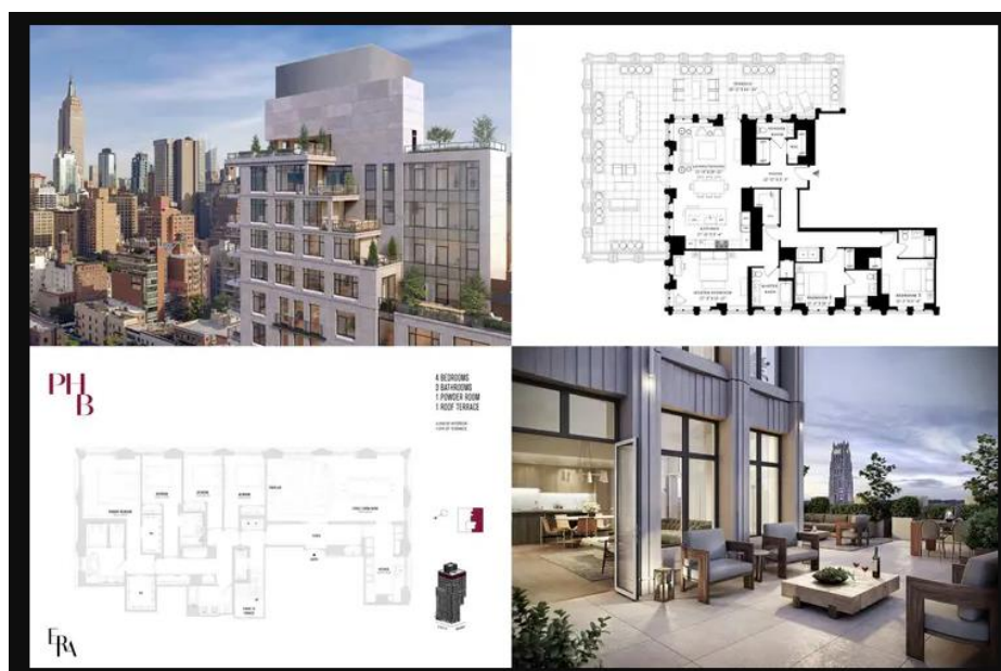
Figure 7: New development apartment floor plans

The results of coordinated urban redevelopment versus ad hoc urban redevelopment differed noticeably in the four case studies. The demand that planning authorities ensure developments was both publicly beneficial and commercially profitable is challenging to meet. While evidence of successful development was present, there was also evidence of speculative activity, inflated property values and the ensuing evictions, and developers who overpaid for land before lowering the bar to cut costs. Flexible planning controls have unquestionable benefits, but frequent changes to policy settings have often been negative. Planning that allows for flexibility to accommodate future changes in flat inhabitant profiles, such as those of families with children, must also be a policy priority. In order to assure the shared use of the private and public spheres, new design and management approaches are required. The spaces in high-density areas work well together (Alawode, 2021).