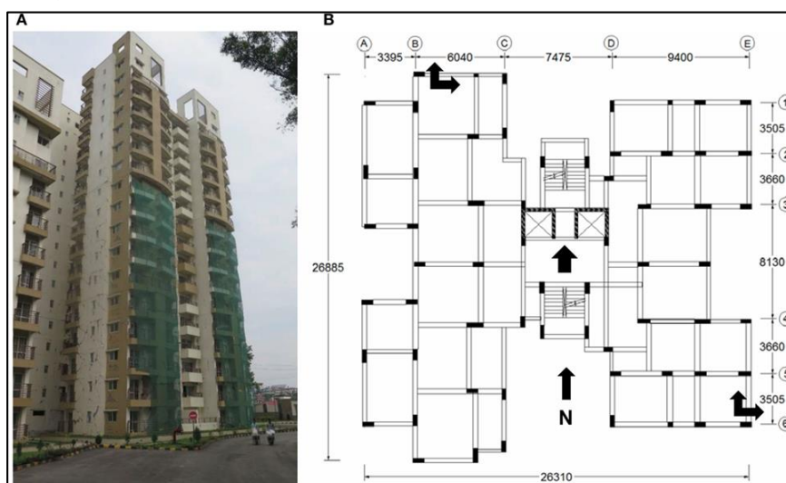
Figure 2: Apartment building sectional elevation plan

A well-run apartment block will benefit its occupants. Similarly, parents who raise their children in a secure, cozy, and peaceful atmosphere will enable the offspring to develop the strength of their respective characteristics to interact with their surroundings and develop into hardy, adaptable, and amiable people. A qualitative research design approach was used to conduct a study on residents' impressions of the flat in order to ascertain the opinions of those who had lived there longer than a year. Given that this approach is based on an interpretive paradigm, where social and personal events are explained using a common sense framework that gives meaning to ordinary occurrences, qualitative research methodologies are thought to be acceptable. Despite the fact that the responses shared by the citizens of Rusunawa are very similar, each resident has a unique perspective on the city. However, they continue to place a lot of weight on the physiological demands, safety, social connection or affection, self-confidence, and self-actualization that are inherent to human beings (Chaplin, 2015).