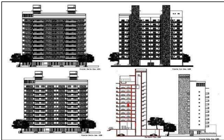
Figure 1: Rusunawa Residential Units

A well-run apartment block will benefit its occupants. Similarly, parents who raise their children in a secure, cozy, and peaceful atmosphere will enable the offspring to develop the strength of their respective characteristics to interact with their surroundings and develop into hardy, adaptable, and amiable people. A qualitative research design approach was used to conduct a study on residents' impressions of the flat in order to ascertain the opinions of those who had lived there longer than a year. Given that this approach is based on an interpretive paradigm, where social and personal events are explained using a common sense framework that gives meaning to ordinary occurrences, qualitative research methodologies are thought to be acceptable. Despite the fact that the responses shared by the citizens of Rusunawa are very similar, each resident has a unique perspective on the city. However, they continue to place a lot of weight on the physiological demands, safety, social connection or affection, self-confidence, and self-actualization that are inherent to human beings (Chaplin, 2015).