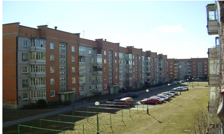
Figure 5 Apartment building front elevation plan on Main Street