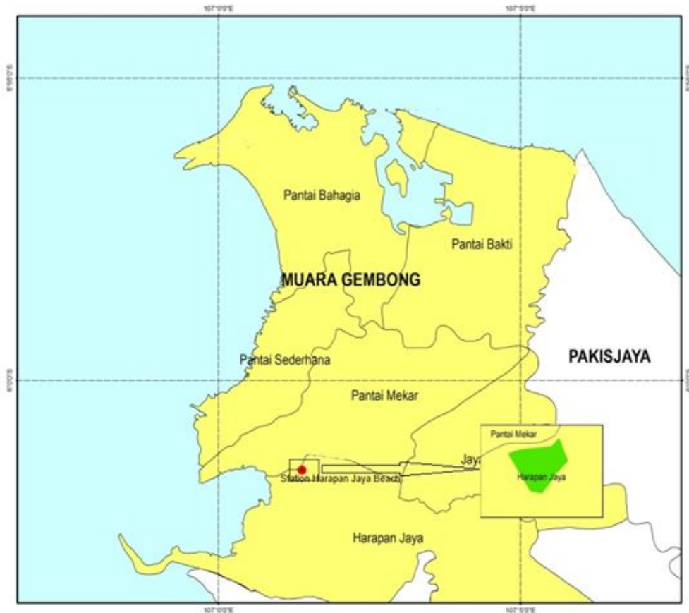
Figure 2. Map of Land Suitability for Mangrove Rehabilitation

Based on the suitability value of each of the above parameters and based on the results of the overlay that has been done, a water suitability map is obtained (Figure 2). Spatial analysis results show that Harapan Jaya Beach area has a land suitability category for mangrove rehabilitation that is quite appropriate (s2). The quite appropriate category has a land area of 12,2Ha. Unsuitable water area is around 9,268 ha.