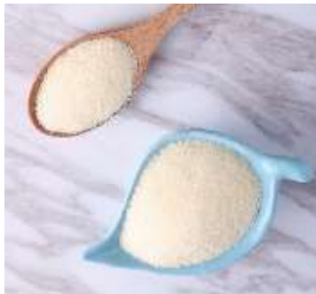
Figure 1. Fish Flour Gelatin

waste in the form of fish bones. Fish bones as waste cannot be utilized optimally and are only reprocessed into feed or fertilizer which has low economic value.