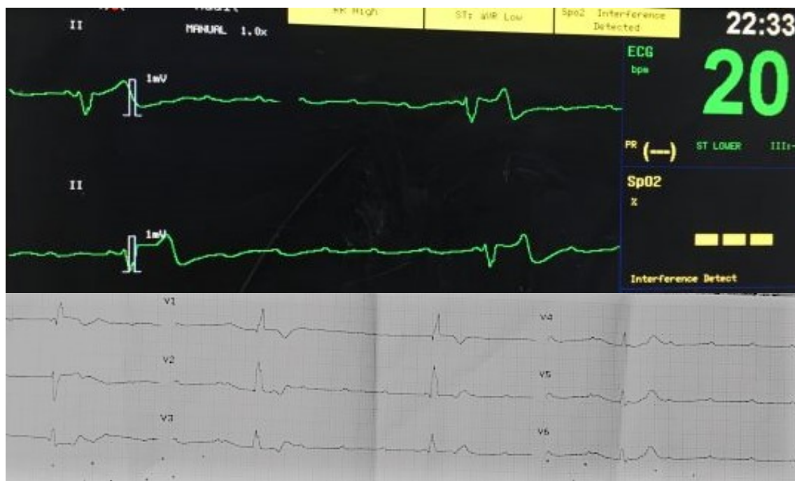
Fig 1 Complete Heart Block with Ventricular Rate of 20bpm.

She was a known case of hypertension and Diabetes since 15 years and was under oral medication that is Linagliptin 5mg, Metformin 500mg and Losartan with Hydrochlorothiazide. On physical examination, she was slightly drowsy with SPO 2 87%. BP was unrecordable but pulse 22bpm, Irregular. Her blood report were normal including her cardiac enzymes report but her random blood sugar level was 355mg. Her blood sugar was managed with insulin infusion. Next day, Single chamber permanent pacemaker implantation was done and got discharged 6 days later without any uneventful events during hospital stay.