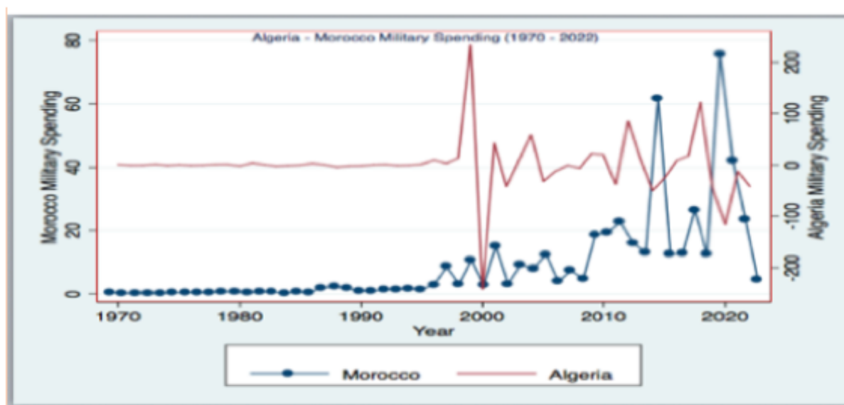
Graph 1. Algeria and Morocco Defense Spending (1970) – 2022)

With reference to table 5. The Moroccan rate of defense spending at lag (1) is significant at the 0.05 level with p-value (0.043), coefficient (0.3681), and standard error (0.1822), while the Moroccan reaction to Algerian defense spending lag (1) is significant at (0.05) level with p-value (0.009), coefficient (0.0062), and standard error (0.0023). The Moroccan reaction to its own armament/fatigue was insignificant for all lags. Nevertheless, the Moroccan grievances vis-à-vis Algeria are significant at (0.05) level with a p-value (0.039), coefficient (0.1157) and standard error (0.0562). The explanatory Power of the model is (R-Squared= 0.878).